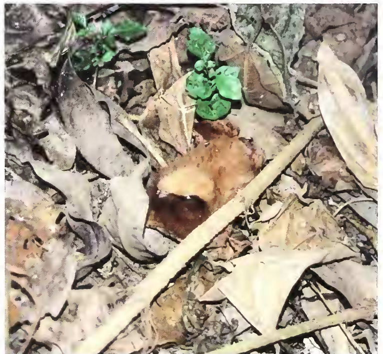
Plate 1. Great Eared Nightjar Eurostopodus macrotis chick, Masipi-East, Isabela province, Luzon, Philippines, April 2002.

On a separate note, the species is commonly reported to be crepuscular i.e active at dusk and dawn. It is indeed active at twilight, but it is also active during the night. Its characteristic call (a sharp 'tsiik', followed after a short pause by a two-syllable 'ba-haaaww') was heard every evening and night.